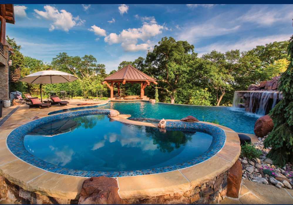
An Essential Safety Guide-Mandatory Reading