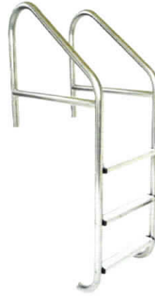
Dade C. Florida