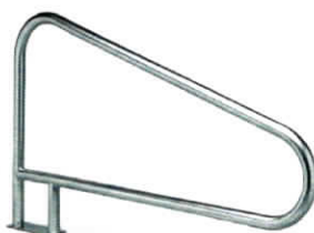
Pool Rail with Flange