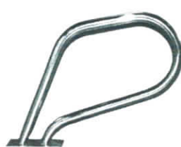
SR-100 Spa Rail